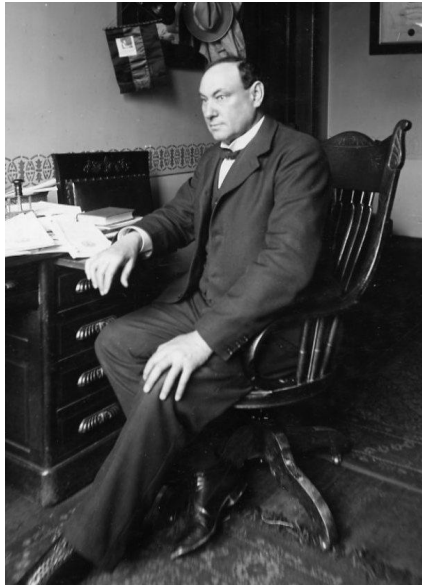
Harvey Wiley was a long and persistent advocate for food safety standards and better regulation of the meat industry; he has been given significant credit for the current safety standards in the U.S.

potential health hazards of consuming meat adulterated with any number of chemicals used as preservatives or colorings. As a result of his findings, Wiley formed the Association of Official Agricultural Chemists, 4 which lobbied the federal government for legislation governing the